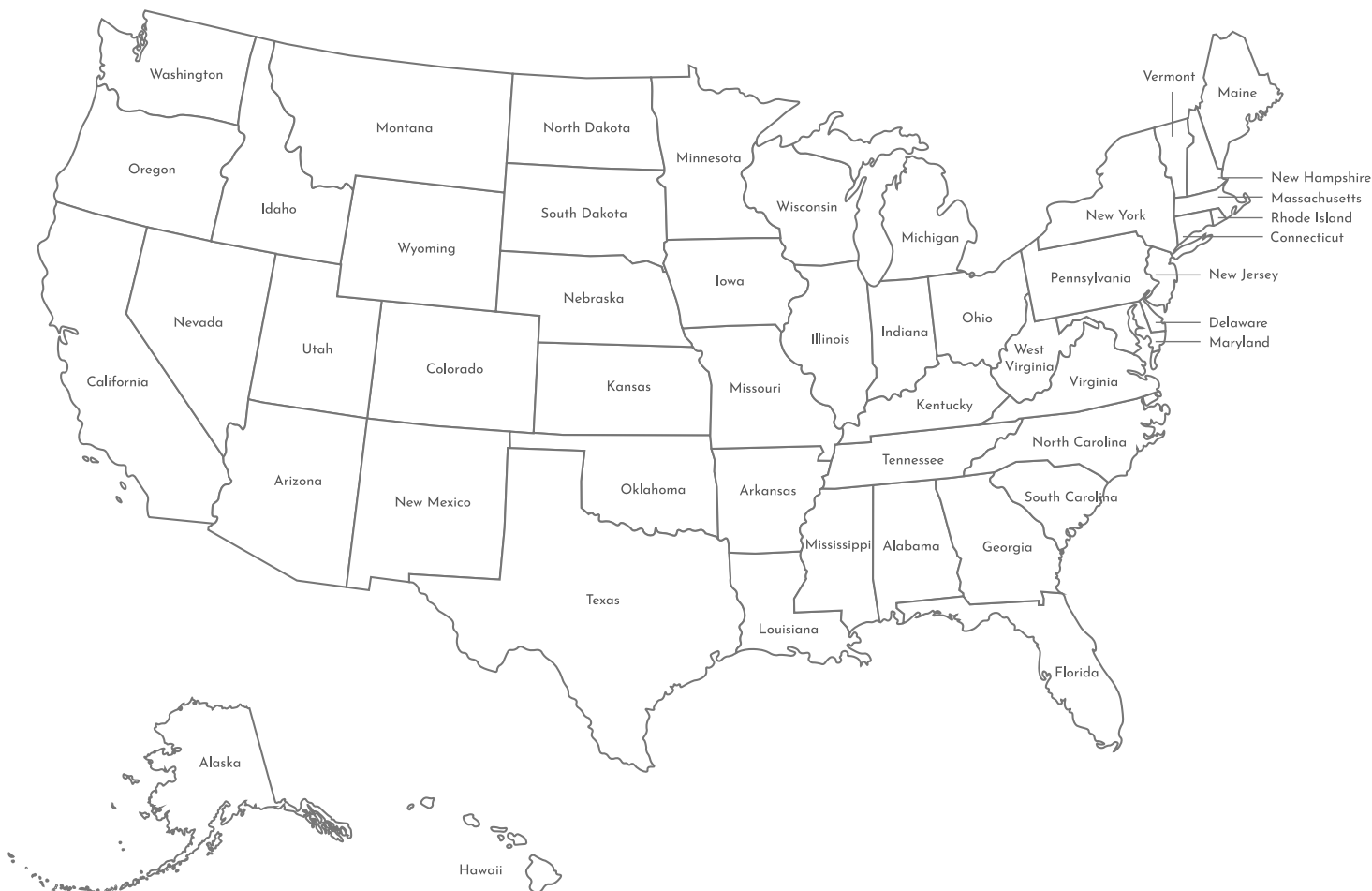
Top States by Agriculture Annual Propane Consumption (million gallons)

On the farm, propane is used for many things. It keeps irrigation engines running, helps dry grain, and makes barns more comfortable for our animals by keeping them warm. The top five states that use the highest amount of propane for agriculture are listed below. Match the shape to the map and use a purple crayon to color in the five states on the map.